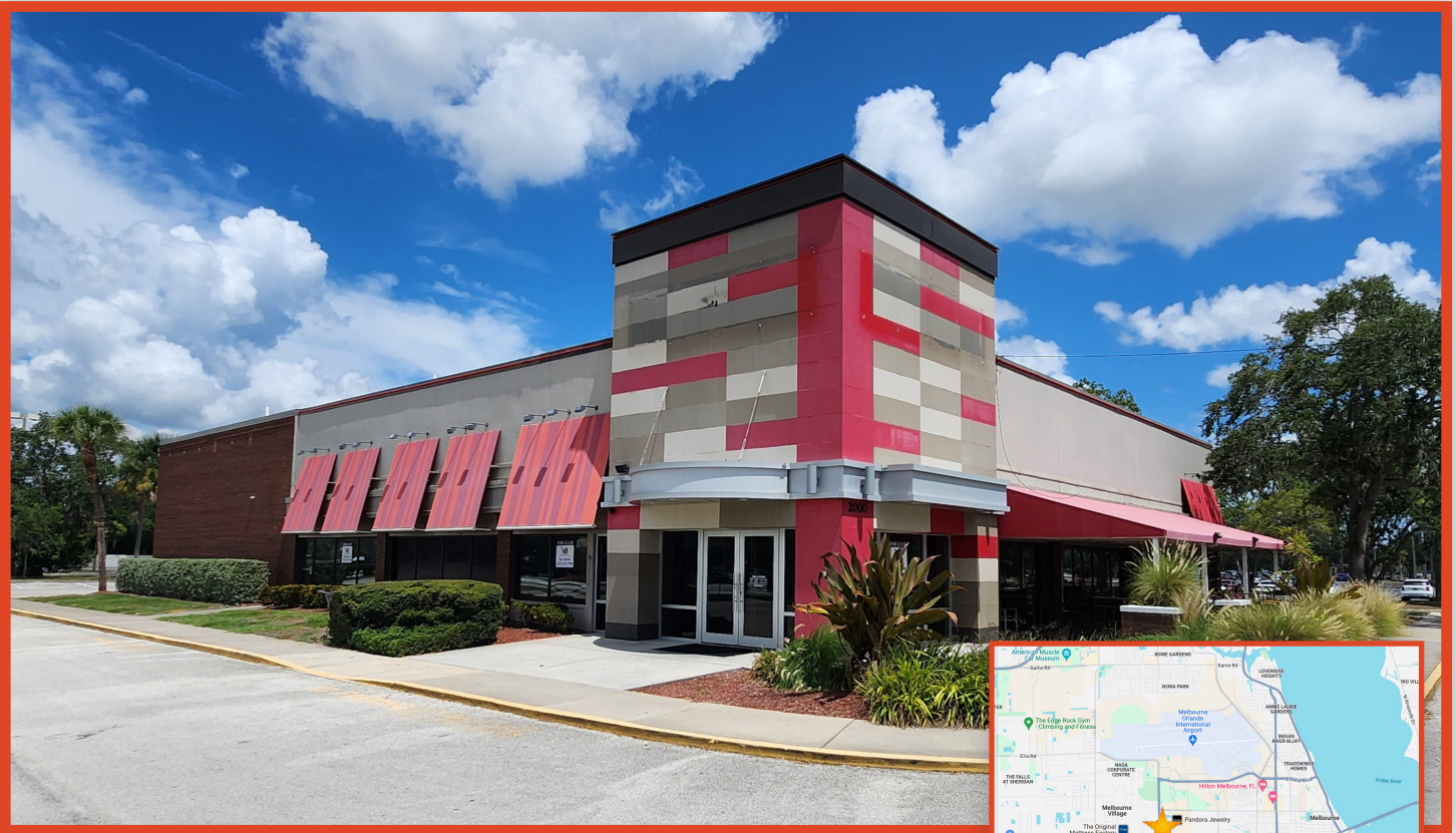
2000 EVANS ROAD, MELBOURNE, FL 32904 HIGH PROFILE RESTAURANT BUILDING / SITE